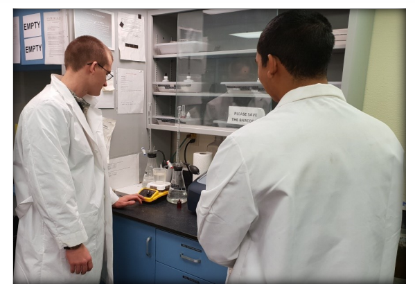
Water Treatment Plant personnel testing the finished water throughout the day.