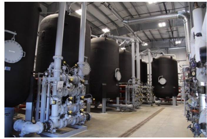
Eielson AFB Water Treatment Plant Granular Activated Carbon system.

If you would like additional information on PFOS and PFOA visit the following web sites: