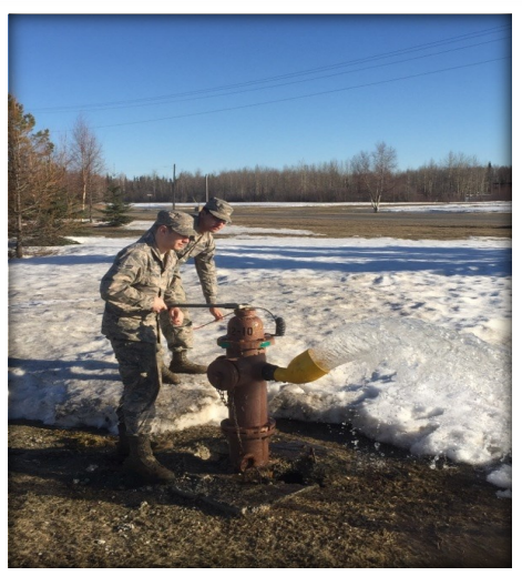
Utilities Maintenance personnel performing routine fire hydrant flushing.