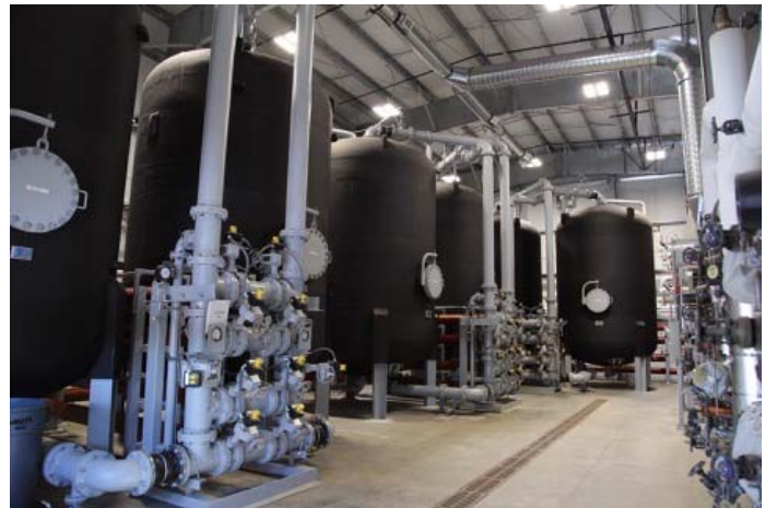
Eielson AFB Water Treatment Plant Granular Activated Carbon system.

If you would like additional information on PFOS and PFOA visit the following web sites: