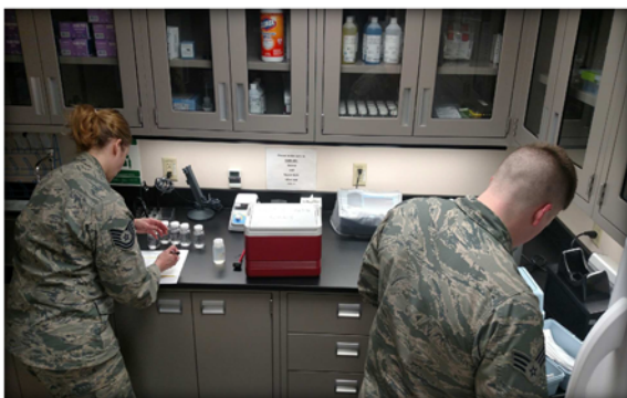
Bioenvironmental Engineering personnel test the base water weekly at various sites throughout Eielson AFB.

You can have the utmost confidence in the team of professionals from the 354 CES Water Treatment Plant, 354 CES Utilities Maintenance, and 354 MDG Bioenvironmental Engineering who are dedicated and committed to providing Eielson AFB with clean safe water.