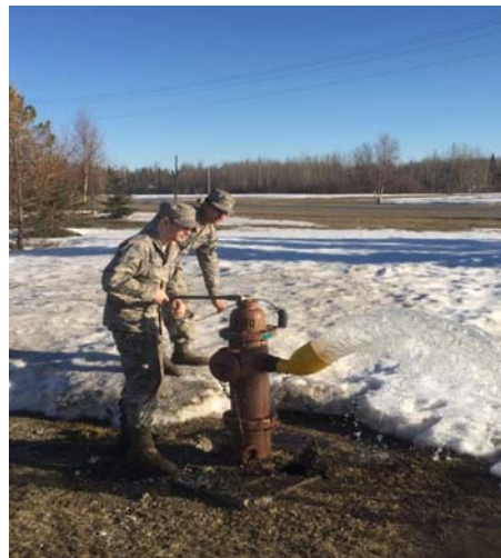
Utilities Maintenance personnel performing routine fire hydrant flushing.